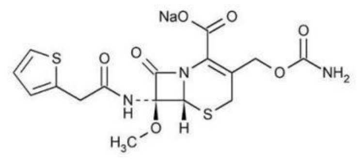
Fig. 1: Molecular structure of Cefoxitin

Cefoxitin [Fig. 1] is a cephamycin antibacterial that differs structurally from the cephalosporins by the addition of a 7- \alpha -methoxy group to the 7- \beta -aminocephalosporanic acid nucleus. It is generally classified with the second-generation cephalosporins and can be used similarly to cefamandole for the treatment of susceptible infections. However, because of its activity against Bacteroides fragilis and other anaerobic bacteria, it is used principally in the treatment and prophylaxis of anaerobic and mixed bacterial infections, especially intraabdominal and pelvic infections. Indications include endometritis (prophylaxis at caesarean section), pelvic inflammatory disease, and surgical infection (prophylaxis). It may also be used in the treatment of gonorrhoea and urinary-tract infections [1]. Literature survey revealed that only a few methods based on HPLC [2-16], LC/MS [17-20], HPTLC [21] and UPLC-MS/MS [22] were reported for the determination of Cefoxitin sodium from dosage forms and in biological fluids either singly or with its degradation products. The present investigation by the author describes a rapid, accurate and precise RP-HPLC method for the determination of Cefoxitin Sodium from dosage forms. The detector responses were linear in the concentration range of 75-225 µg/ml of the drug. The method was validated as per ICH [23] guidelines.